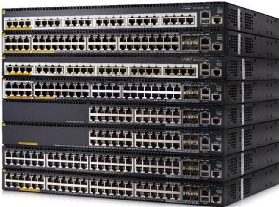
HPE Aruba Networking 2930M Switch Series

The HPE Aruba Networking 2930M Switch Series provides a simple and powerful access layer solution that can be quickly set up at branch offices with little or no IT support using Zero Touch Deployment. The switches include a Limited Lifetime Warranty.